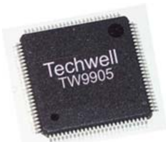
Techwell's TW9905 100-pin PQFP package

The TW9905 supports flexible pixel interface. It outputs YCbCr (4:2:2) data stream over 8-bit or 16-bit data path. The output is VMI 1.4 compatible.